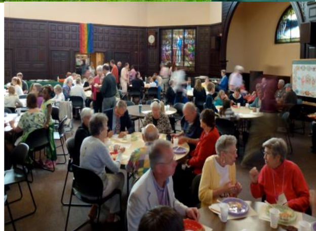
A large crowd enjoyed the Indoor Picnic.

Now I must add a disclaimer. While we do tithe, we do not pledge all of it to the church. We keep some aside for other things that we feel God is calling us to support, such as a camp that promotes peace between Palestinian and Israeli youth. Come December, we feel very rich when we sit down