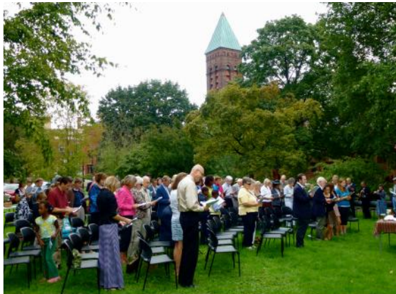
Worship in Washington Park