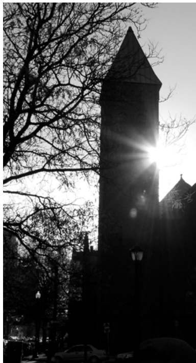
Advent - "... to give light to those who sit in darkness ... to guide our feet into the way of peace" Luke 1:79